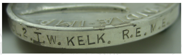
Condition Generally GVF. Court mounted