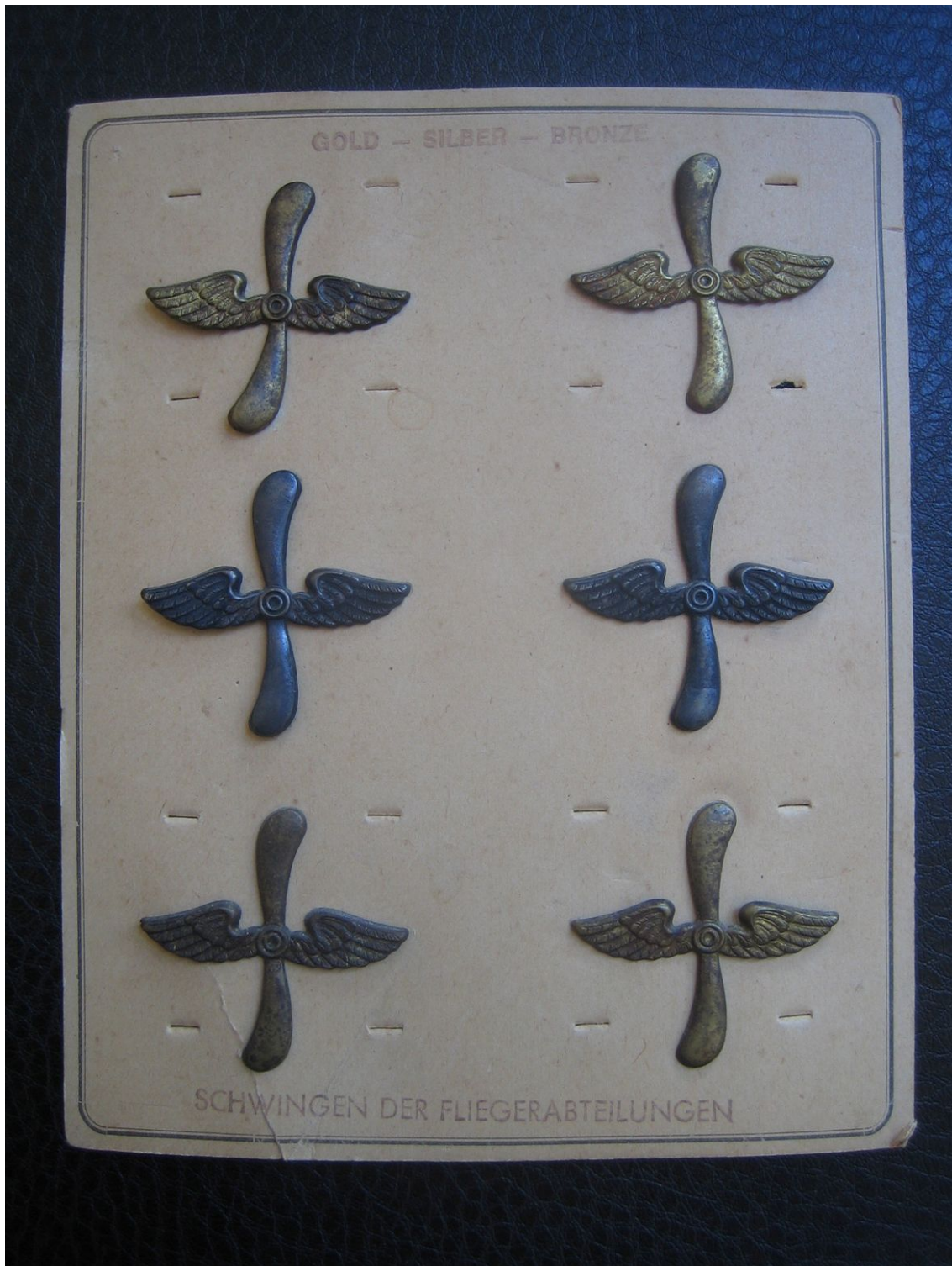
A rare original manufacturer's card of WW1 German pilot/Observer's metal winged propeller devices for shoulder boards.