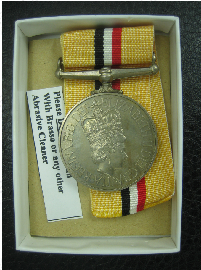
IRAQ 2003, NO CLASP '25084601 LCPL L BISHOP PARA' WITH NAMED CARD BOX OF ISSUE