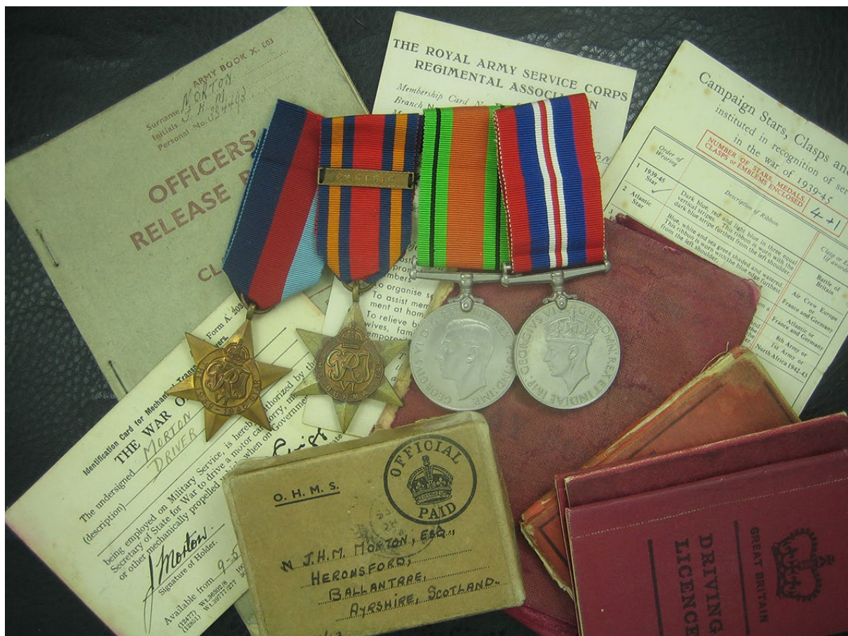
1939-45 STAR, BURMA STAR WITH PACIFIC CLASP, DEFENCE AND WAR MEDAL, WITH NAMED BOX OF ISSUE AND TRANSMITTAL SLIP