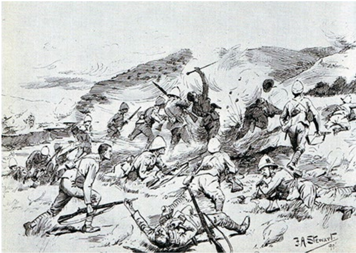
THE INNISKILLING'S AT COLENZO