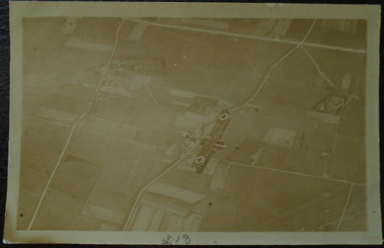
GERMAN PHOTO OF A LVG C.VI IN FLIGHT. THIS PHOTO TAKEN IN THE EARLY SUMMER 1918.