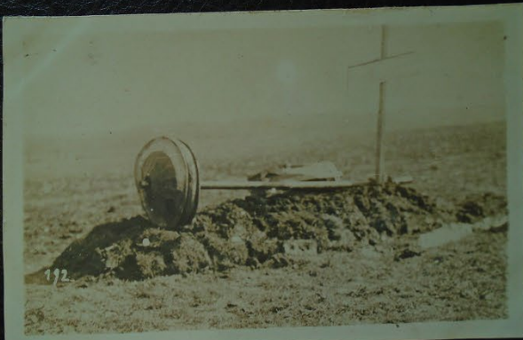
GERMAN PHOTO OF AN UNIDENTIFIED AVIATORS GRAVE MARKED WITH THE WHEEL AND THE AXIL FROM THE AIRCRAFT.