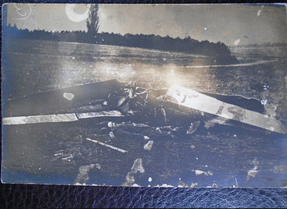
GERMAN PHOTO OF A CRASHED NEUPORT 28 OF 95 AERO SQN PILOT QUENTIN ROOSEVELT YOUNGEST SON OF PRESIDENT THEODORE ROOSEVELT LIES DEAD BESIDE THE AIRCRAFT.