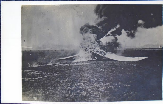
GERMAN PHOTO OF AN UNKNOWN BURNING AIRCRAFT