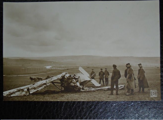
GERMAN PHOTO OF A CRASHED FOKKER EINDECKER