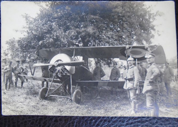
GERMAN PHOTO OF A CAPTURED FRENCH NIEUPORT 11 N1586