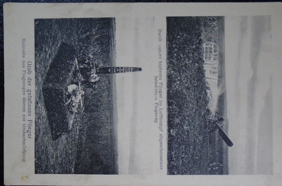
GERMAN PRINTED CARD OF A CRASHED AND BURNT FEZ 6 6949 OF 11 SQN LT H.T.L. SPEER KIA 2LT W.A. WEDGWOOD K.I.A. BOTH CREW BURNT WITH AIRCRAFT ON 9th JULY 1916. BURIED BY THE GERMANS TOGETHER AND GRAVE SHOWN.