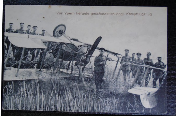
GERMAN PHOTO OF A BE2c 2019 OF 2SQN IN COMBAT WITH FOKKER ENGINE DAMAGED ON 5th JANUARY 1916 2LT ALRUSSEL P.O.W. SHOT DOWN OVER VITRY LT E. HESS KEK. CREDITED