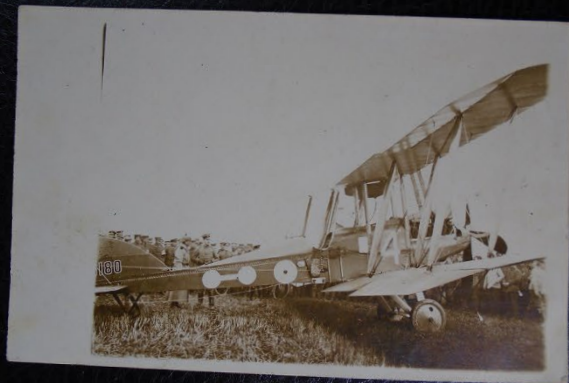
GERMAN PHOTO OF A CAPTURED BE2