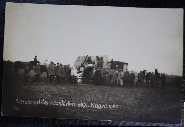
GERMAN PHOTO OF A CAPTURED BE12 6180 OF 19 SQN LOST IN ACTION ON 23rd OCTOBER 1916 DURING A BOMBING MISSION 2LT R. WATTS P.O.W.